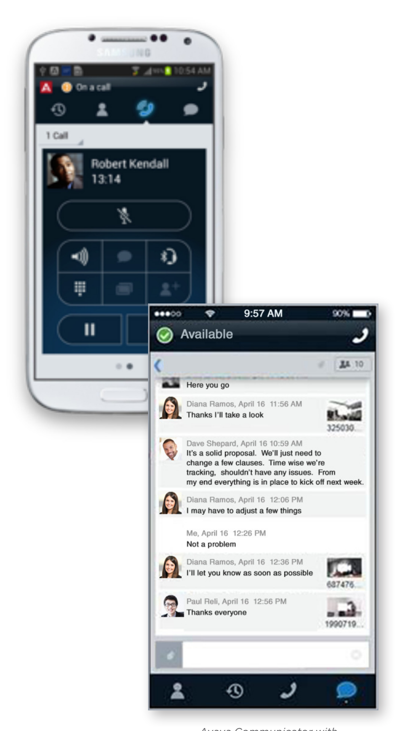
Avaya Communicator with Avaya Multimedia Messaging

Enterprise Instant Messaging : Avaya Multimedia Messaging combines the power of text-based messages with voice, plus audio, video and picture files. Take messages with you - access messages across different devices with secure message and storage. Send messages regardless of recipient's login state. Organize individual and chat groups with subject-based threads.