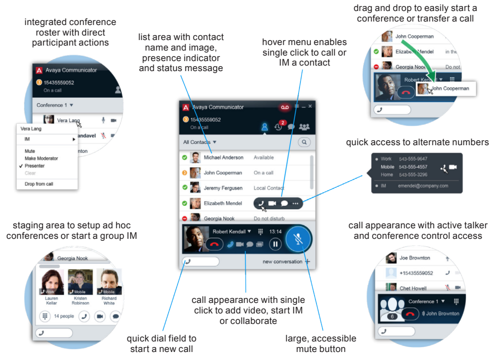
Avaya Communicator for Windows main user interface

Contact your Avaya representative and visit www.avaya.com to learn how Avaya Communicator together with the full suite of Avaya office and mobility solutions can help you support your business objectives.